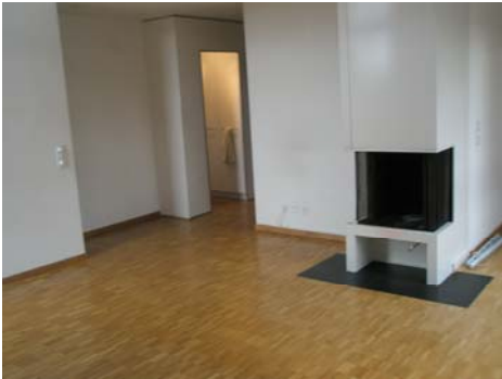
Living room with fireplace